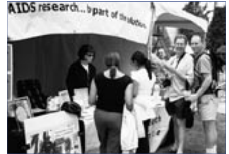
ARA's booth at CSW 2003.